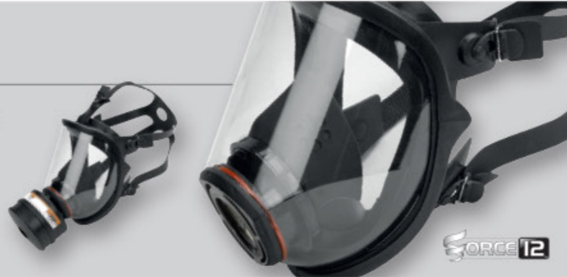
BPJ000-011-000 Force12™ full face mask without DIN canister