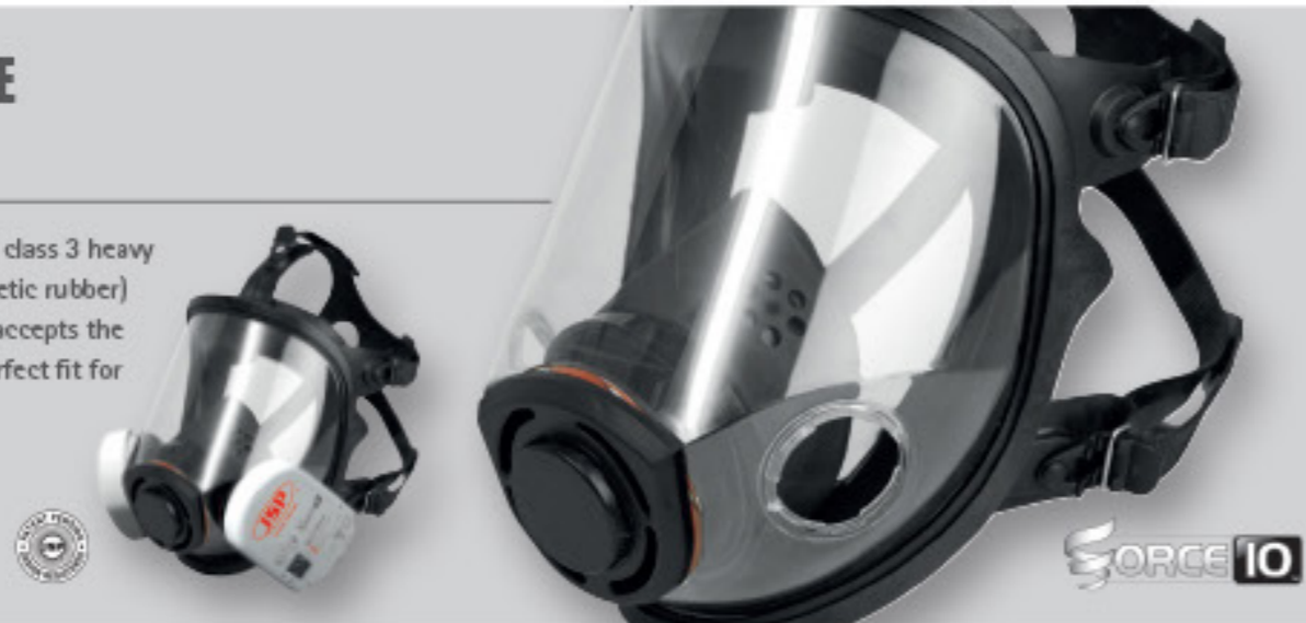
BPK000-011-000 Force10™ full-face mask - Boxed without twin filters