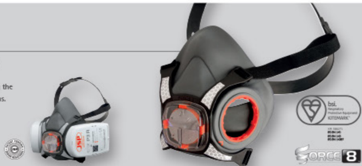
BHT003-0L5-000 Force8™ half mask - Boxed without twin filters